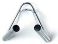
Seated row handle

The following equipment is included in Personality Gym: