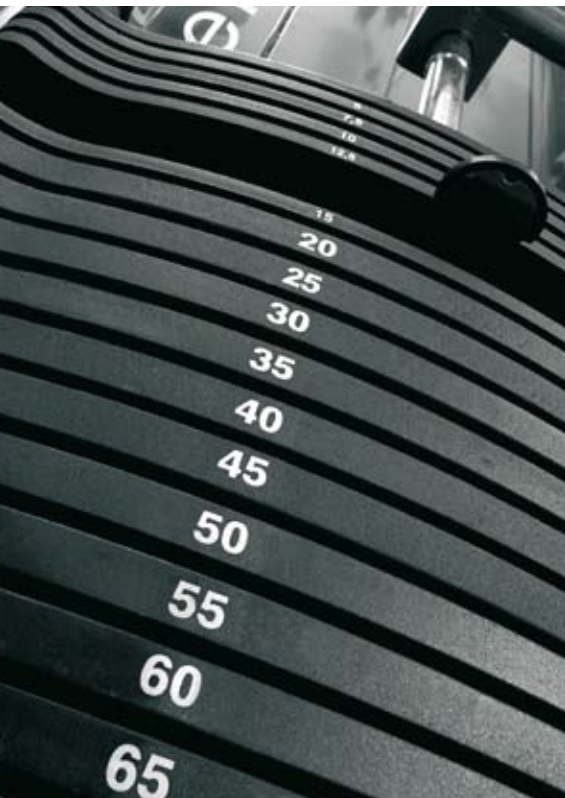
Weight stack up to 80 kg.