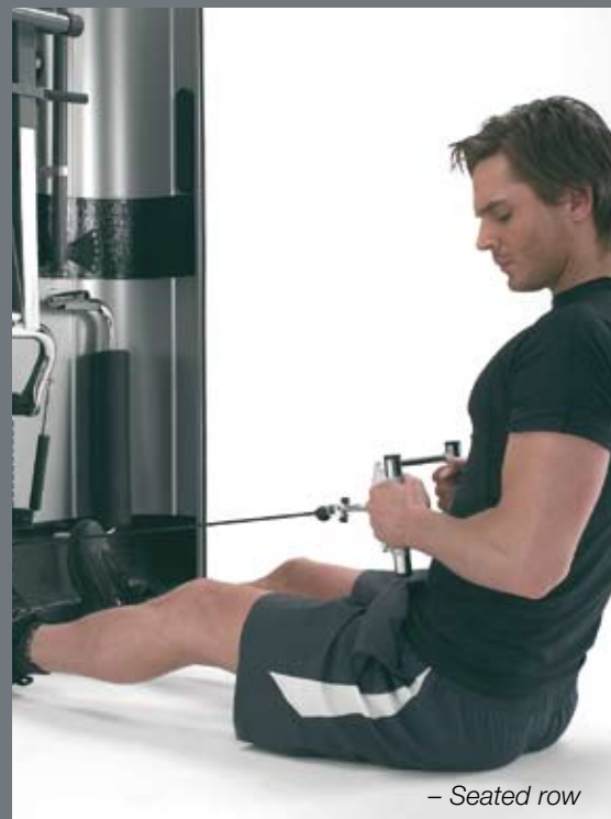
- Seated row