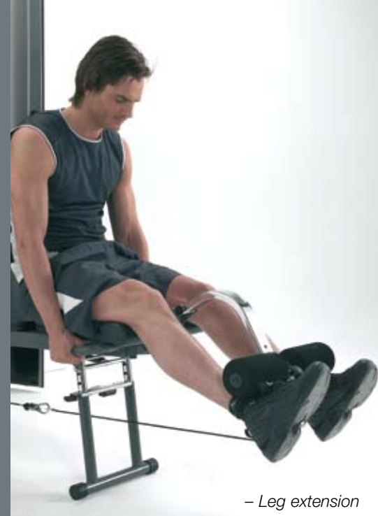
- Leg extension