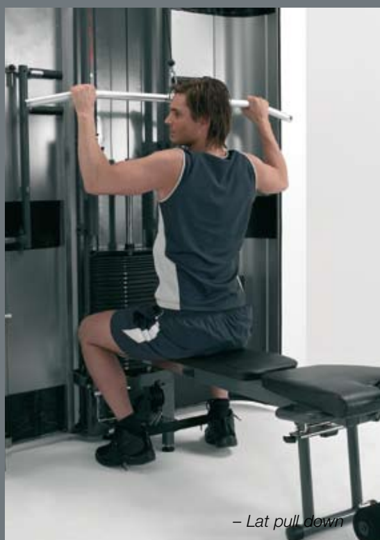
- Lat pull down