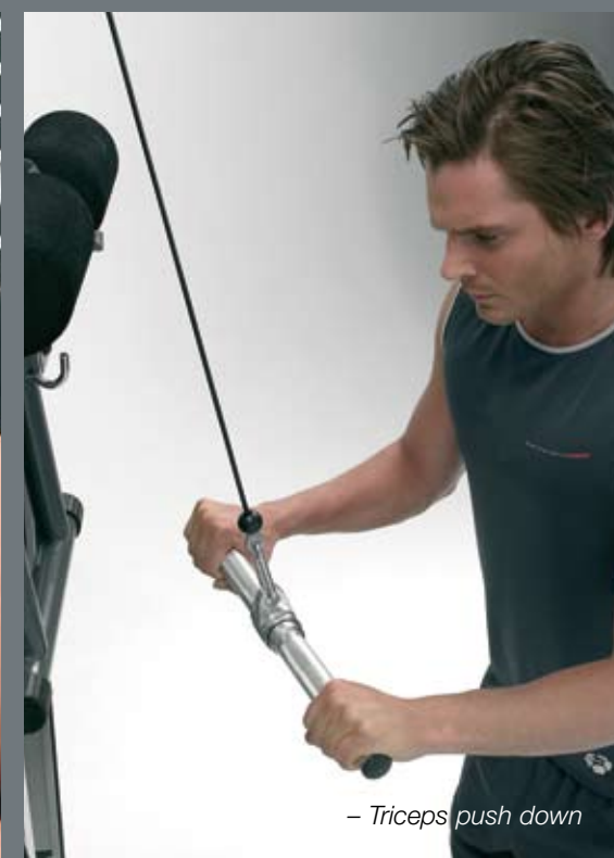
- Triceps push down