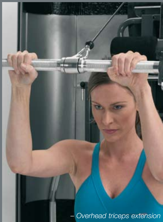
- Overhead triceps extension