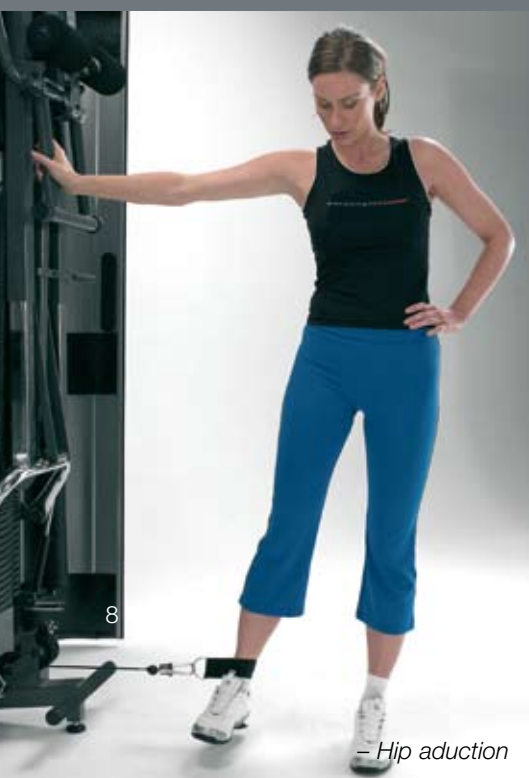
- Hip aduction