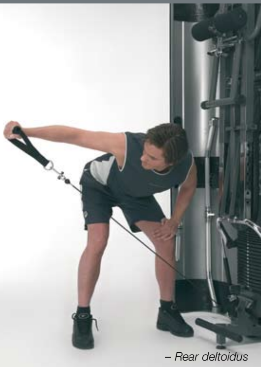
- Rear deltoidus