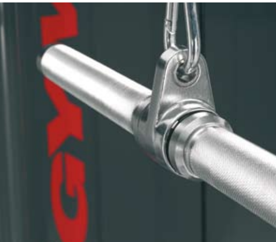
Every detail of the high quality fittings has the finest of surface finishes.