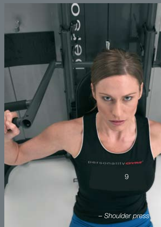
- Shoulder press