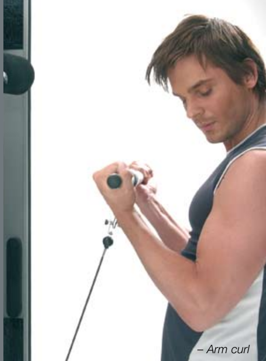
- Arm curl