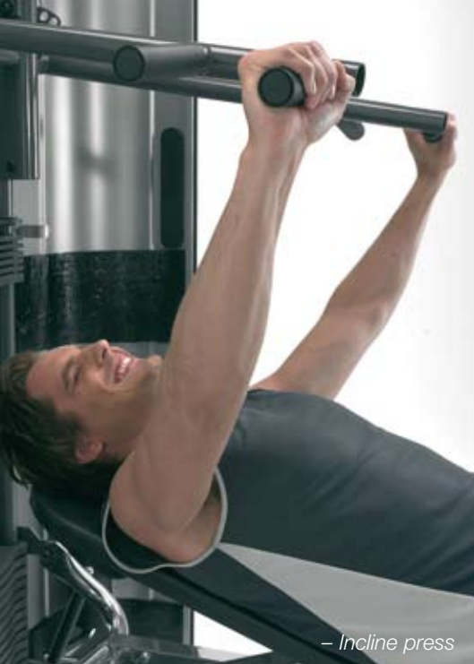
- Incline press