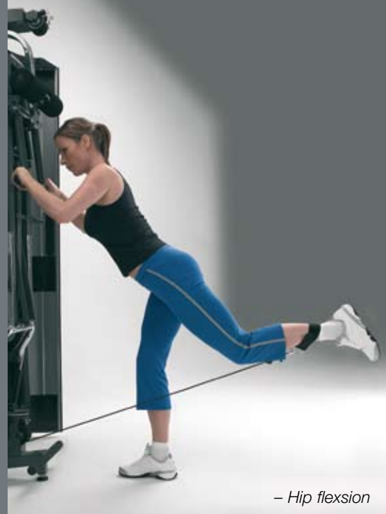
- Hip flexion