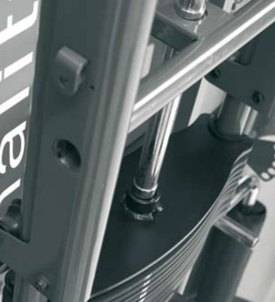
Precise, noiseless motion with sound-insulated bushings.