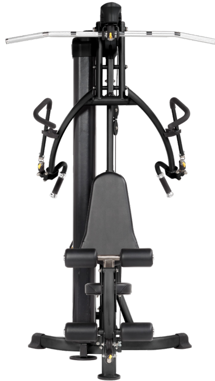
STRAP HANDLES WITH 3 LENGTH CHOICE RINGS