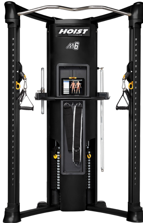
SILENT STEEL® WEIGHT SYSTEM