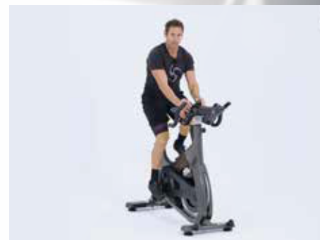
INSTRUCTIONAL VIDEO SERIES