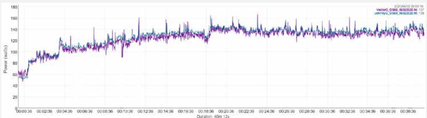
Graph from DC Rainmaker Analytics Tool

Our competitors use a strain gauge measurement for power on their exercise bike, which is actually carried over from the outdoor bicycle industry. The weakness with strain gauges is that they require batteries and drift over time, requiring recalibration. The Johnny G Spirit Bike utilizes the medical industry technology and does not need to have batteries replaced or to be recalibrated. The below graph compares the Johnny G Spirit bike to the Garmin® Vector 3 pedals: accuracy of the power meter.