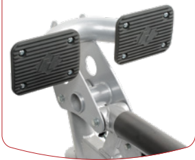
MOLDED FOOT PADS